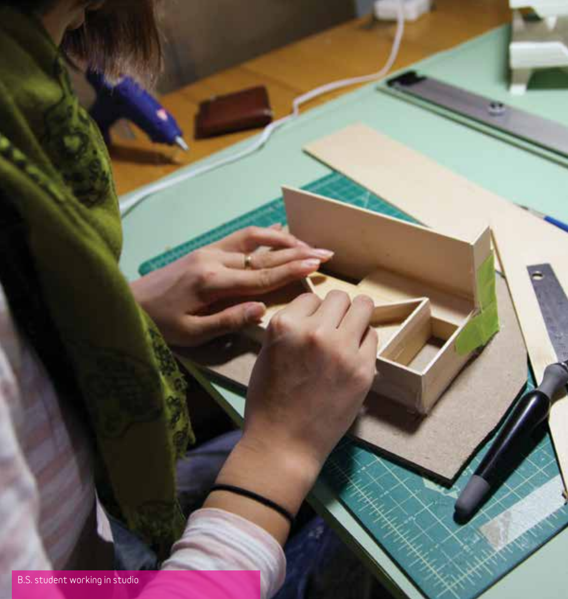
B.S. student working in studio

In the first two years, students engage in the study of the liberal arts in addition to architecture, giving them a broad educational experience and allowing them to develop the critical tools and knowledge essential to the study of contemporary architecture. During the last two years, students focus on