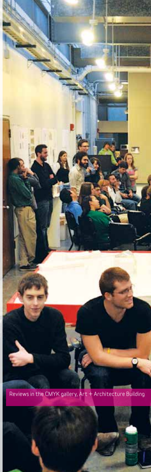
Reviews in the CMYK gallery, Art + Architecture Building

Please visit taubmancollege.umich.edu/applyundergraduate for more detailed information about our undergraduate architecture degree, application instructions, to schedule a visit, or to register as a prospective student.