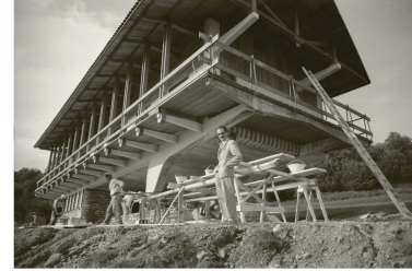
Molino, Casa Altopiano Di Agra